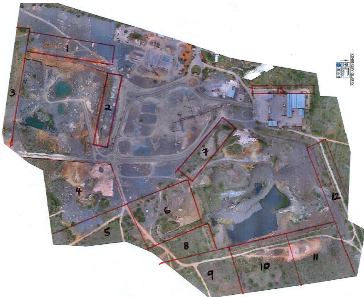
Figure 1: Invasive plant species management areas of Kimberley Quarry. Note: To optimise space, true north is directed to the right.

As everyone isn't familiar with the identification of plant species, photographs of the most important species to be controlled on site were included below for ease of reference.